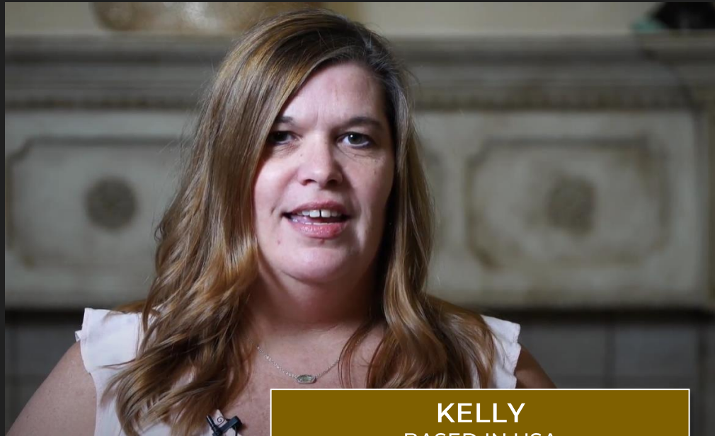
KELLY BASED IN USA

"I highly recommend working with Eram Saeed—she's no-nonsense and delivers exactly what she promises."