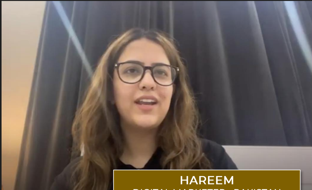
HAREEM DIGITAL MARKETER - PAKISTAN

"The number one benefit I experienced was the realization that all the answers I was seeking were already within me. That discovery was life-changing."