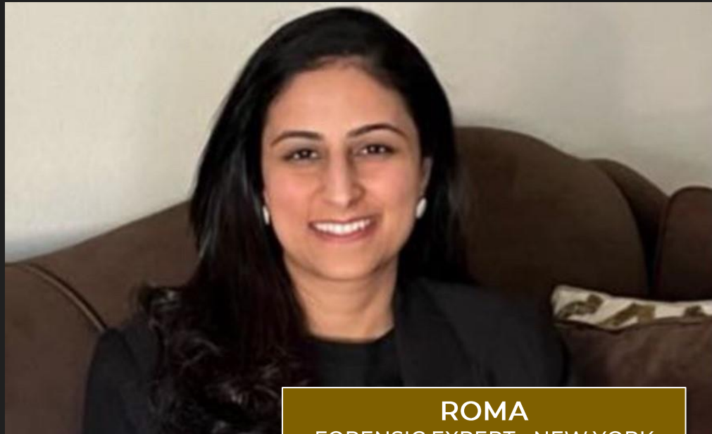
ROMA FORENSIC EXPERT - NEW YORK