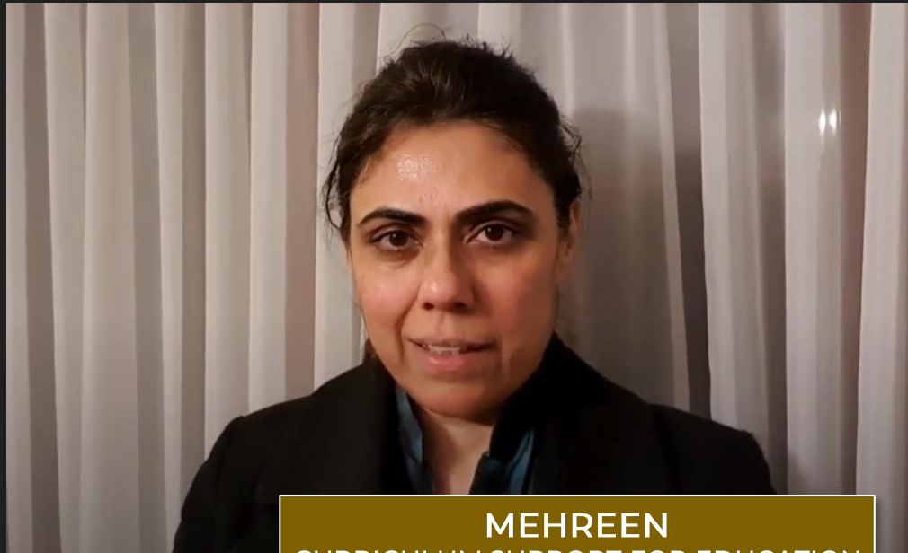
MEHREEN CURRICULUM SUPPORT FOR EDUCATION SYSTEMS - NEW ZEALAND

"Within just weeks of joining Eram's course, I gained clarity and emotional control, and it rekindled my trust and faith in Allah."